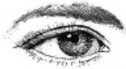
Your undilated pupil