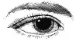
Your dilated pupil